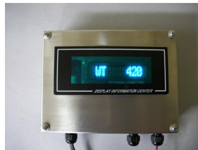
Serial 4-20mA protocol converter